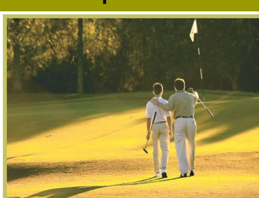
Saturday, June 14th, 2014